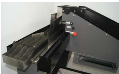
Fast, robust and reliable.