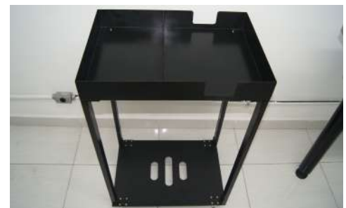
Support table for banknote tray.